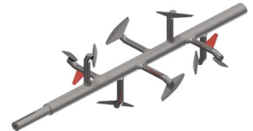
Paddle with Leveling