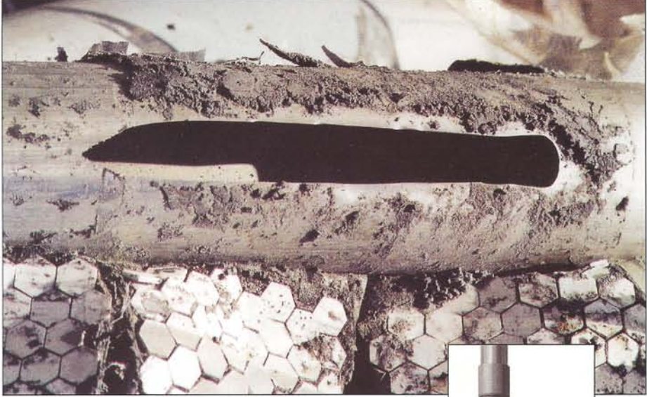
A common sight at RheTech before the HammerTek Smart Elbows® were installed was an attempt at patching with ceramic tiles and duct tape.