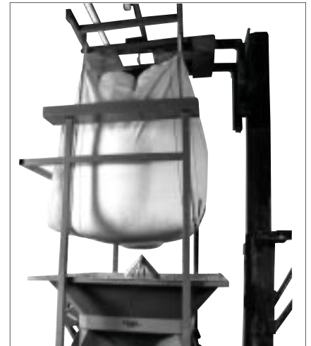
Flo Clean discharger