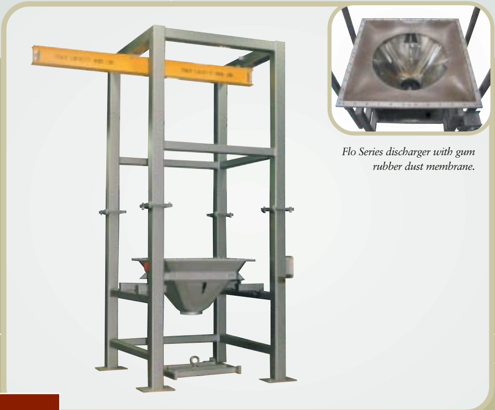
Flo Series discharger with gum rubber dust membrane.

6500 Kestrel Road, Mississauga, ON L5T 1Z6 telephone: 1-800-736-5739 email: sales@controlandmetering.com or visit us on the web at: www.controlandmetering.com