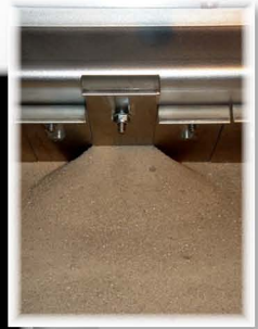
One RatePlate™ opened