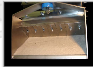
RatePlates™ at "fully closed" position