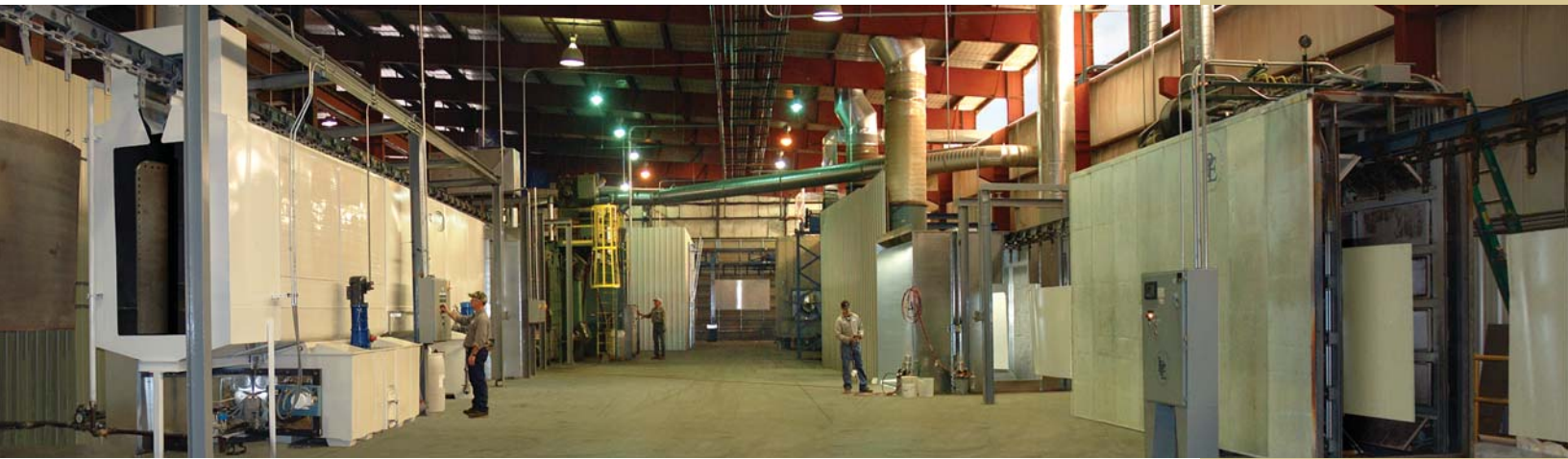
The BOSS Tank powder coating facility has a line rating capacity four times greater than any other bolted tank manufacturer.

Fusion 5000 FBE™... the BEST CHOICE to specify for Dry Bulk Storage Tanks!